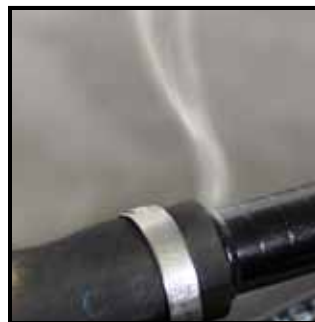
Smoke exposes the leak.

The cabinet design provides technician-friendly onboard storage of all adapters and accessories.